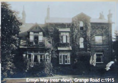
Ermyrn Way (rear view), Grange Road c:1915

The oldest existing private school in Ashted is Downsend , in the west corner of Grange Road and Leatherhead Road, noted in the 1871 census for Ashted as Leatherhead Road Boarding School. At that time open only about three years and operated by the Rev Edward T Scudamore, it had 14 boys aged from 8 to 13, looked after by a matron, a cook and two housemaids. The premises were in the residence called Gateforth House on the present site.